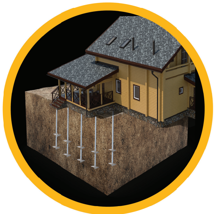
Decks and Additions